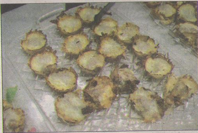
Above, the finished product, Lasagna Cupcakes made from scratch. Below, the teens get to enjoy the fruits of their labor with a tasty supper.